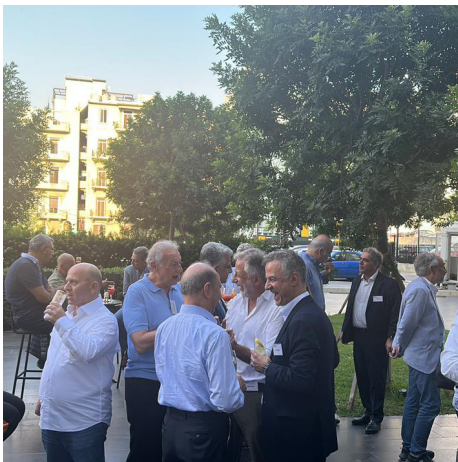
RDCL Members' Gathering