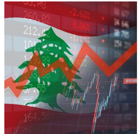
Financial Crisis & Financial Gap Conference

RDCL members are kindly asked to stay attentive to the official WhatsApp group and email updates, as all important events will be communicated through these channels. Dates and details will be shared with members in due course.