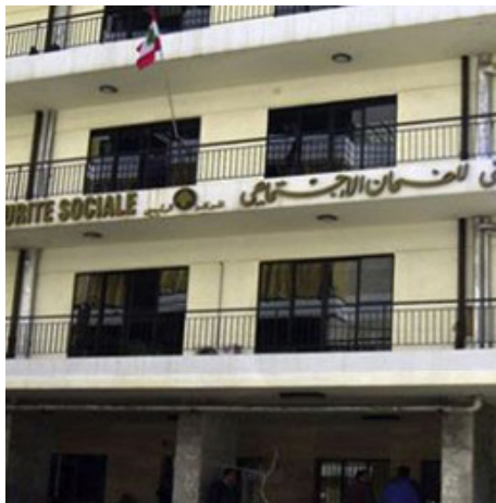
End-of-Service Indemnity Conference